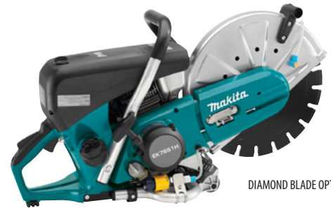
DIAMOND BLADE OPTIONAL